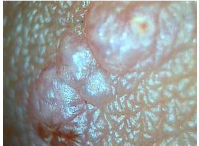
Fig.2.The mite burrow the skin of penis×60

The mite burrow with several holes linearly located on papulovesicular lesions (Figure 2) was detected by dermatoscopy of the penis. Dermatoscopy of the buttocks determined typical mite burrow filled with liquid.