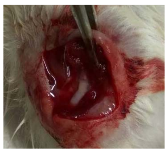
Fig. 3. Reconstruction with acellular fibrin matrix and fibrin matrix with nMSC

cells of rats ( Fig. 3 ). In Experiments 3 and 4, the ends of the biomatrix were connected to the ends of the nerve trunk with the help of fibrin glue, which was prepared 15 minutes before application.